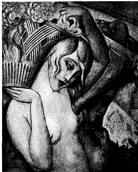
A portrait of Lill Elbe, the former male artist Einar Wegener, painted by his former wife, Gerda Wegener (Grete Sparre). The picture shows the distinctly effeminate form of the body, probably result of hormone changes.

I have since been able to gather additional information about her from independent sources, and have learned that she has spent at least one period, and probably more, in prison, for fraudulent misrepresentation, and have learned further