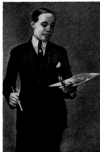
Einar Wegener (Andreas Sparre) the Danish artist, taken in 1929, before operation to change his sex. Note female appearance of face and his effeminate hands. It is impossible to change sex.

tor, with a few additional details, and requested me to apply on her behalf to the appropriate governmental authorities to permit her to be officially registered as a male. I had to explain to her that, in England the authorities would not consent to such a change. This appeared to depress her greatly. Her next request was that I should graft a penis and testicles on to her body. I replied that this was a physical impossibility, and that no surgeon in the world could do such a thing. This appeared to depress her even more. She then asked me to carry out the male hormone implantation operation, which had already been suggested