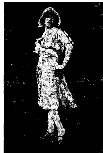
Lili Elbe (formerly Einar Wegener) photographed at the women's clinic, Dresden, Germany, 1930. The male artist, after several operations, had now become a female, or so he believed.