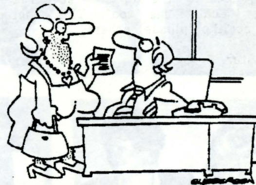
"You advertised for a temporary girl?"

1905 E. Camelback Colonnade Mall Phoenix, Arizona 85016