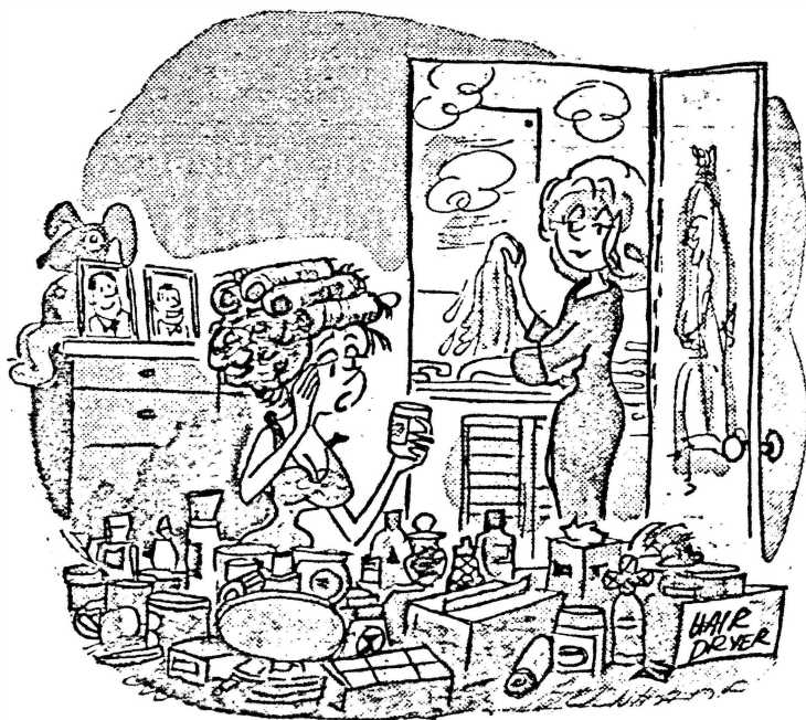
"Wow! What I go through getting ready for a Chapter meeting."