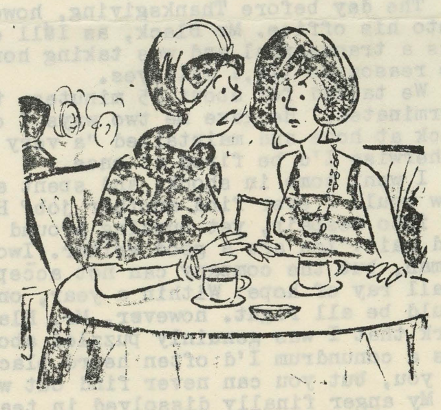
"All I have is my boy credit card!"

Plat it safe and consult a local lawyer.