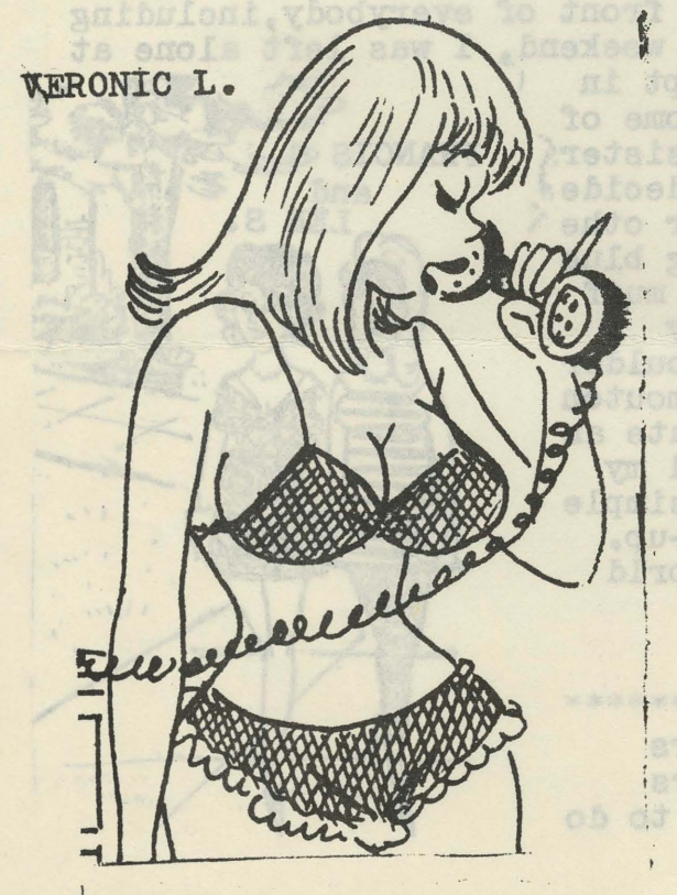
"Dootor...can a guy take too much estrogen?"