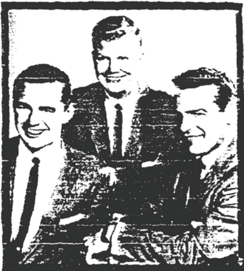
Billy Tipton (center) in the 1950's