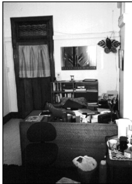
Intersex Society of New Zealand opened an office in the Pacific Ghyia Center, May 1997.