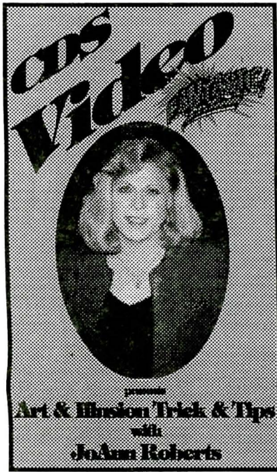
VHS - approx. 55 minutes ea.