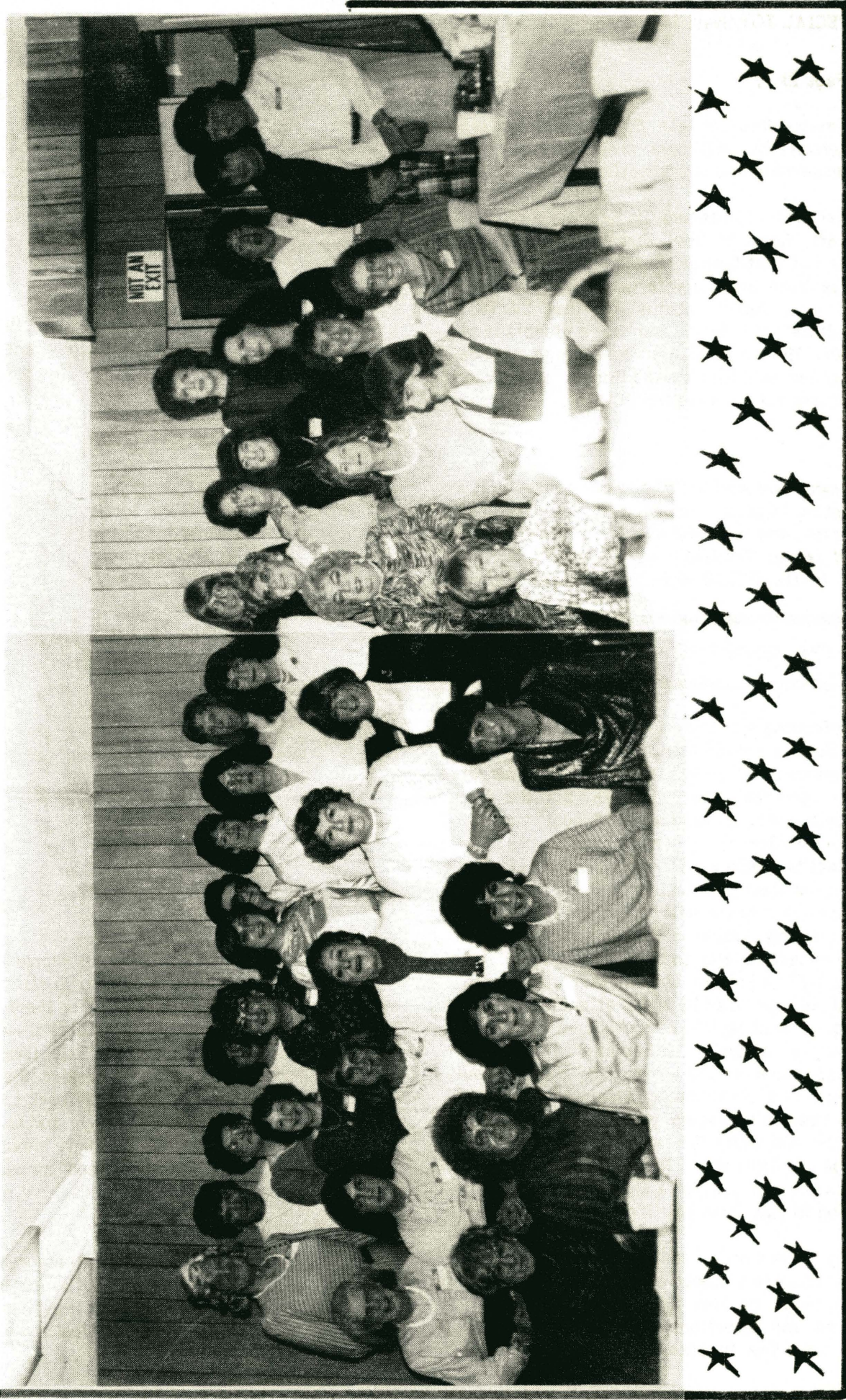
CHI DELTA MU CHAPTER MEETING, APRIL 1985