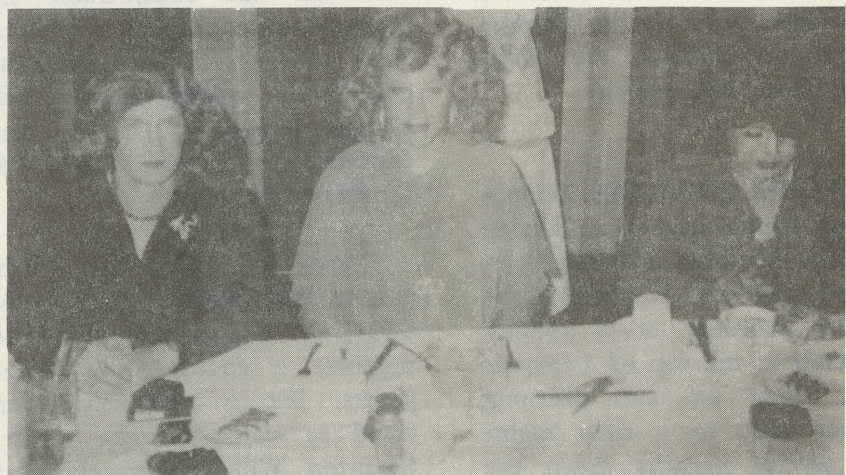
RIGHT: These three lovely sisters wonder how long it is going to take for the waiter to bring their meal at Alpha dinner.