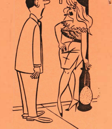
"I'm warning you, Madge — one day you'll have to choose between our marriage and your career.'

Returning to London, she fell fatally ili, refused medical attention and asked to be buried without examination. But