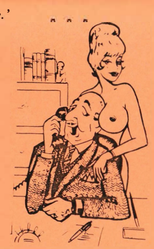
"I'm afraid I can't make it today . . . I'm to my ears in work."

As a closet transvestite, alack and alas, My only companion is my looking glass! How often I think, as I mow the grass, Being a male is a pain in the ***!