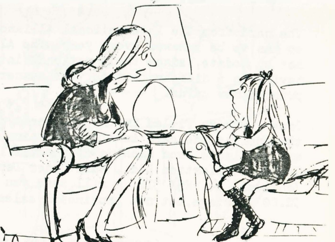
"Darling, if you want Mommy to keep dressing you up as a girl, you're going to have to stop putting frogs in my purse."

GILDED GRAPE..42nd St. & 8th Ave. N.Y.C. The ORPHEUS..1203 Butternut st. Syracuse, N.Y. THE YUM YUM TREE..Governors Drive West.. HUNTSVILLE, ALABAMA.. FRONT PAGE BAR,& Resturant..2258 Young Ave.. Mephis, Tennessee. (send me more places where TVs are welcome)