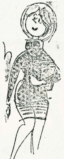
What the well-dressed college man is wearing now!

HINTS: Those who have a "shadow problem",use PERFECT FINISH BY ELIZABETH ARDEN:: Those who have a skin problem use B 10 BY H. RUBENSTEIN:: For the eyes; GLAMOURIZE INSTANT EYELINERS-32 pairs in a box. They are self-adhesive and can be re-used.