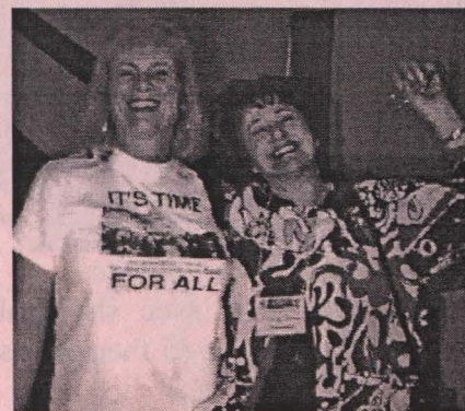
Remember, Woman is as Woman does.