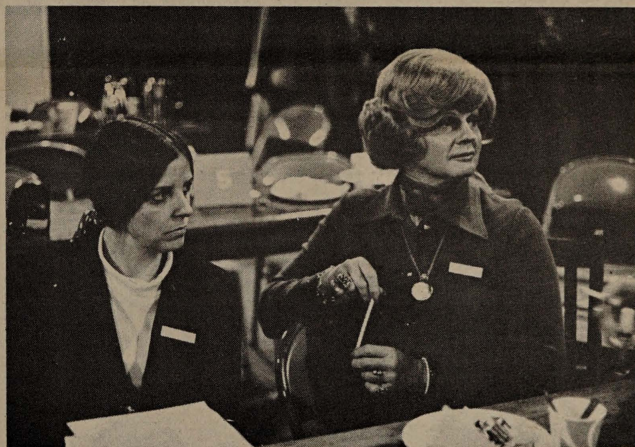
. . . a lot of theories. I guess you have to talk to a lot of people and find out what makes them tick.