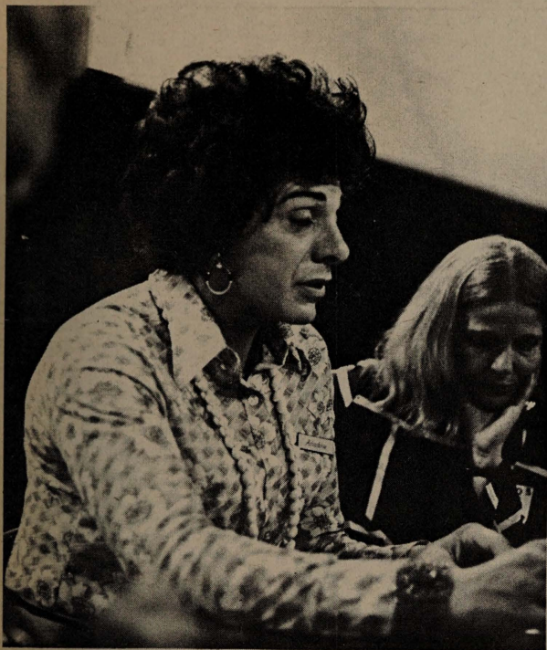
Identity change is a large gray area, but where there aren't laws a Probate Court judge can order the City Clerk to change records.

These pictures were taken at a transvestite/transsexual conference. At this conference people spoke about the subculture, and about their views and society's views of it.