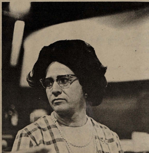
Here's a great fallacy. When you win, you don't lose.

. . . he may start going to drag balls. That confuses the gay community!