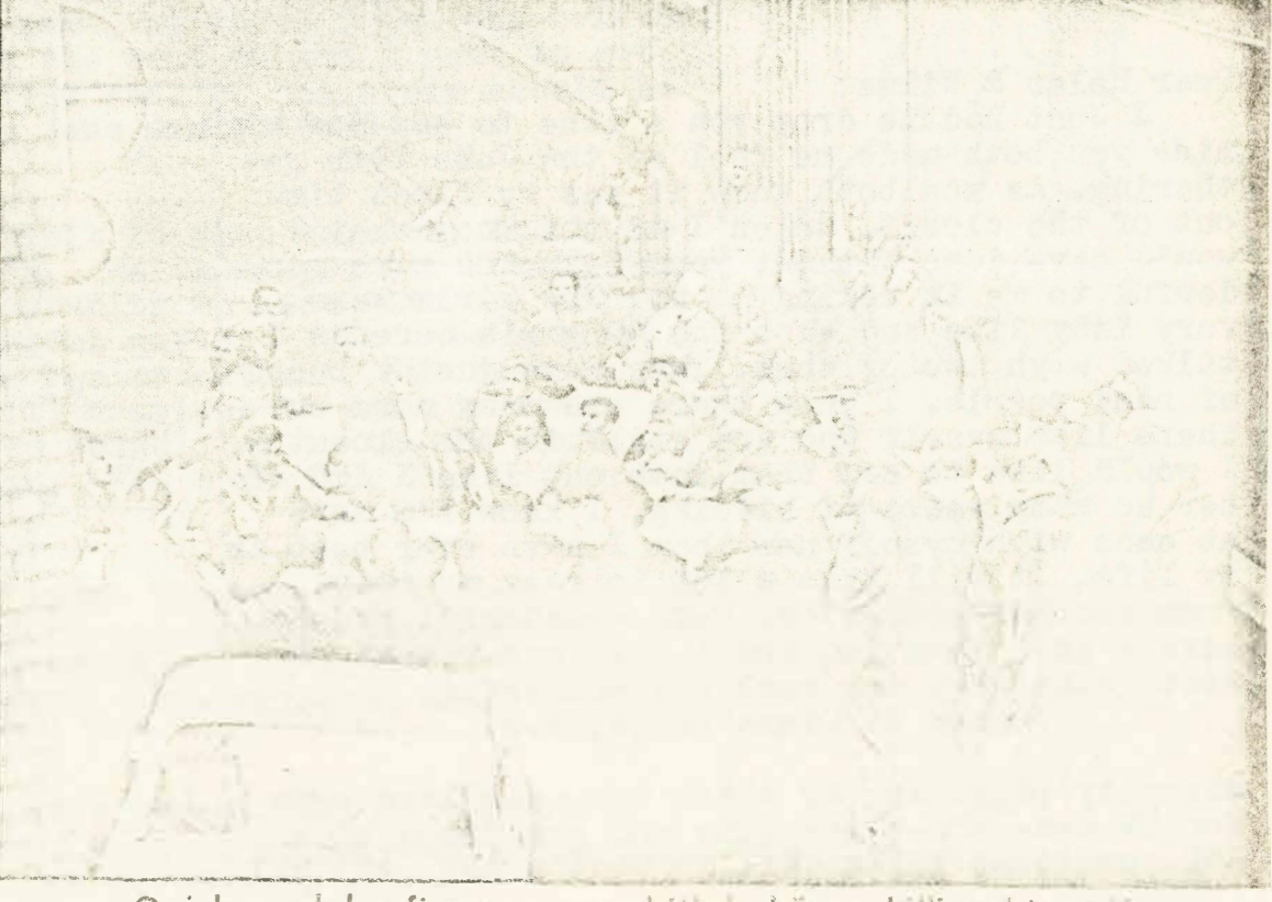
Quick work by firemen saved Klapel from killing himself