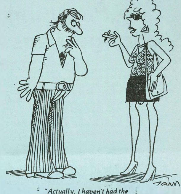
4 "Actually, I haven't had the operation yet.