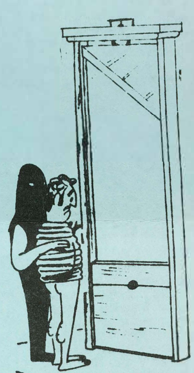
HAD IN MIND FOR MY SEX CHANGE OPERATION!