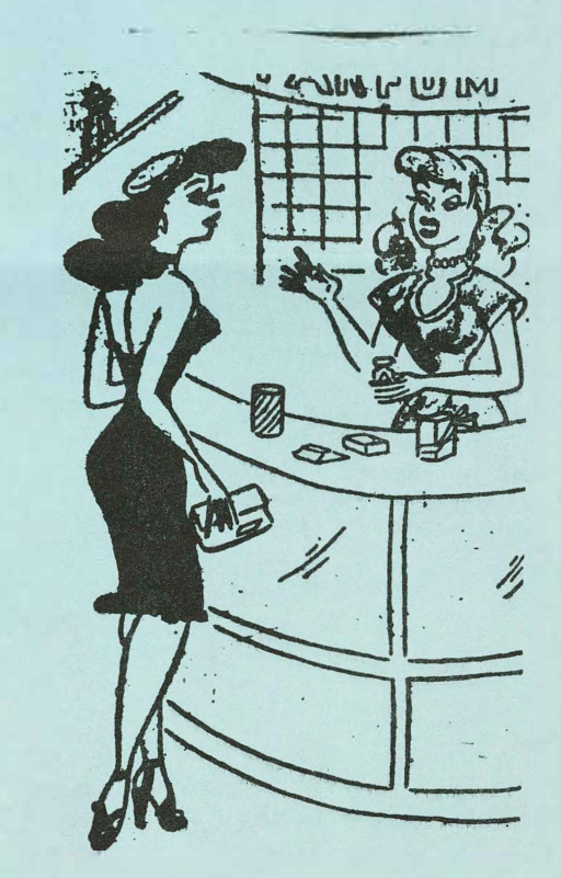
"Jimmy, you've got to stop coming here dressed in my clothes. My boss would fire me if he knew I was married!"

SHE FIGHTS WITH THE NEIGHBORS JUST TO KEEP IN PRACTICE UNTIL YOU GET HOME