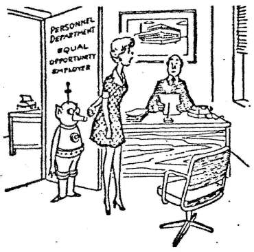
"If you thought my being a TV was a problem, wait until you see this!"

News-Chronicle, Section 2 Page 20 - Wednesday, August 10, 1977