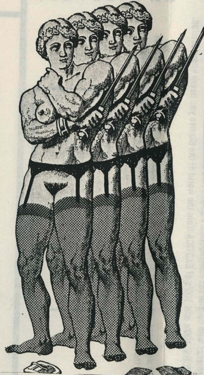
attacked him at night in a park, two holding him down while the other two pulled off his trousers. He was saved when a passer-by called the police.

LONDON —Four women, aged 17 to 27, have been jailed for attempting to rape a man. A London night-club manager told the court the women